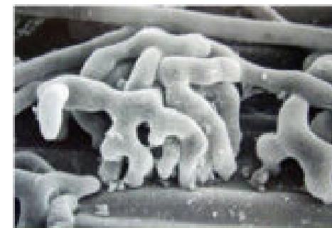
Fungal growth inside plants - before application of Armor 70 WP

Damping-off, Leaf Blight, Basal and Neck Rot, Leaf Blotch, Powdery Mildew, Smut and Botrytis Rot