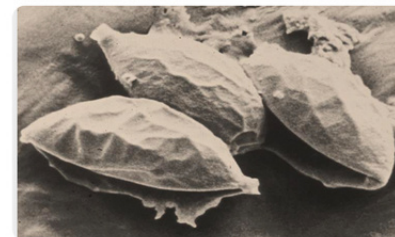
Spores damaged - after application of Leadonil 500 SC