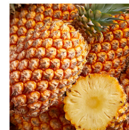
Pineapple Blanket application on broadleaves and annual grasses