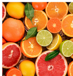
Citrus Blanket application on broadleaves and annual grasses