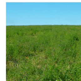
Non-crop land Direct spray on annual and perennial grasses