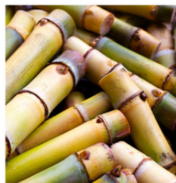
Sugarcane Blanket application on broadleaves and annual grasses